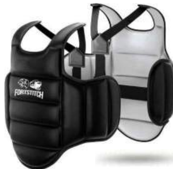
Design 1 FSPG-003