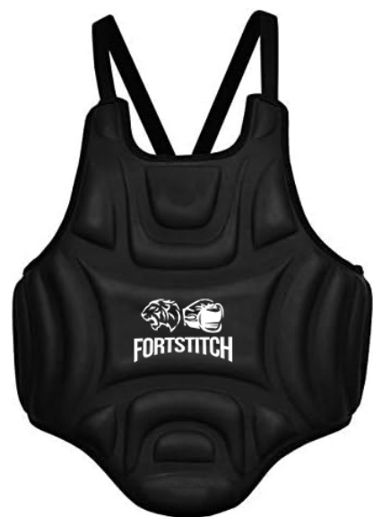
Design 1 FSPG-002

Tailored for the elite in boxing, MMA, Muay Thai, kickboxing, and contact sports, our Heavy Hitter Body Protector ensures unfaltering body protection. Experience the confidence to unleash full-powered hits while training, knowing you're shielded by the best.