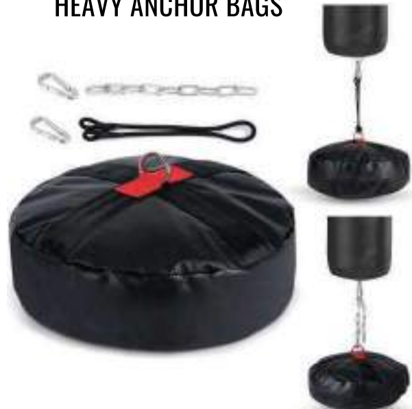
HEAVY ANCHOR BAGS