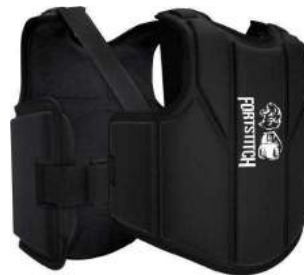
Design 1 FSPG-004