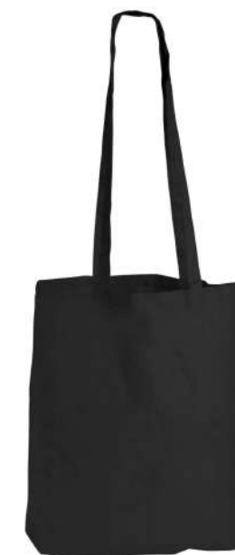
Tote Bags FSTB-001