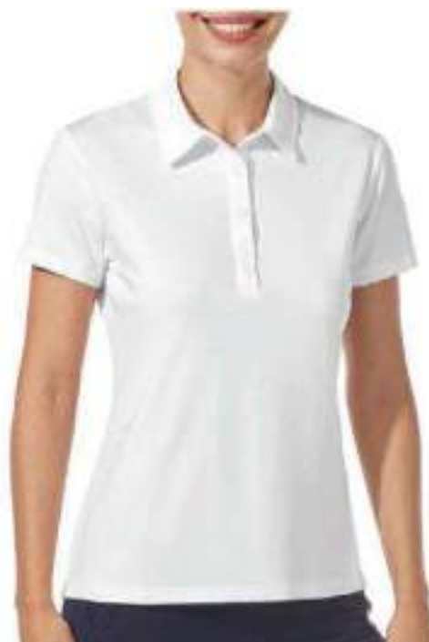
POLO SHIRTS FOR WOMEN