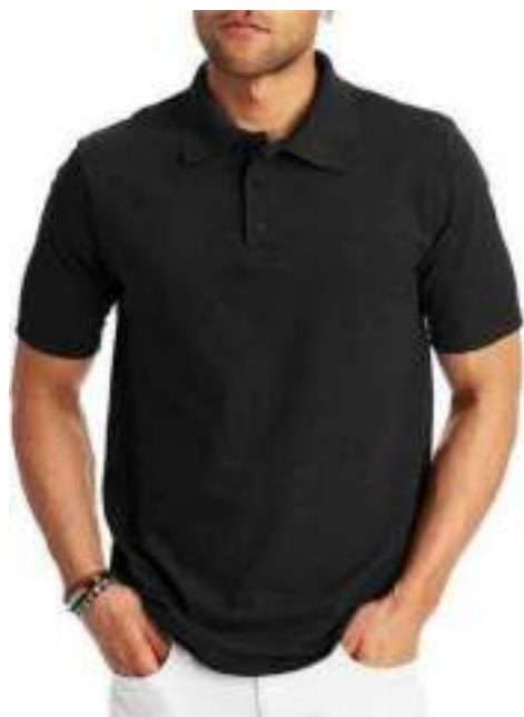
POLO SHIRTS FOR MEN