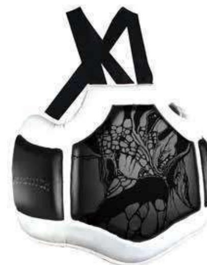
Design 1 FSPG-006