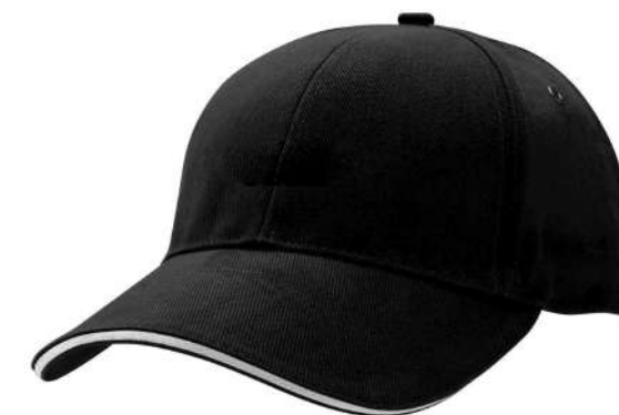
Sports Cap FSSC-001