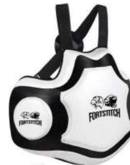
Design 1 FSPG-005