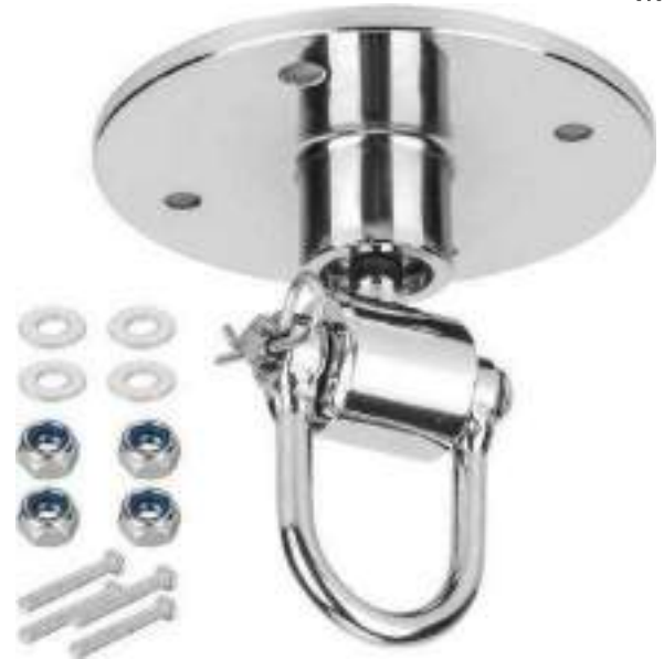
HEAVY BAGS MOUNT HANGER