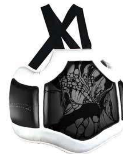
Design 1 FSPG-006