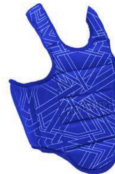
Design 1 FSPG-004